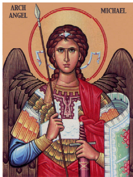
I stand before God