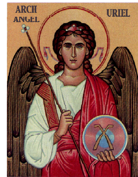
I burn for God