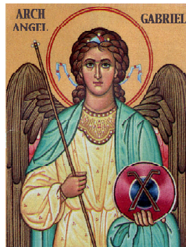
I speak for God