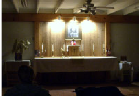
The Chapel at Excelsior Center

You may read book reviews on Amazon.com at: http://tinyurl.com/23q8cy