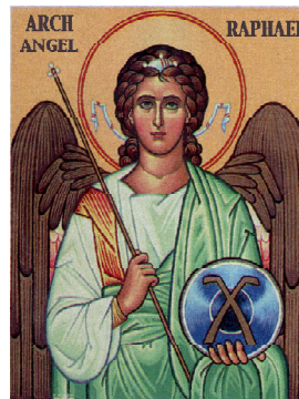
I heal for God