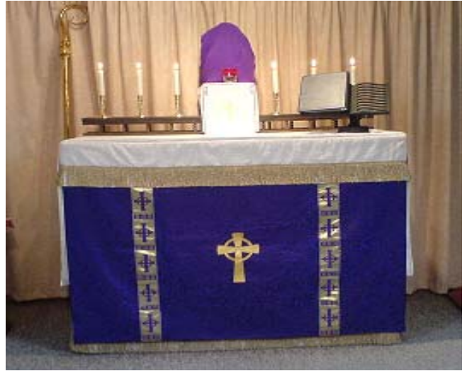
APPERLEY LANTERN ALTAR