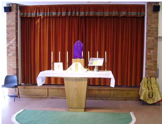
THE HIGH ALTAR AT NORTON VILLAGE HALL